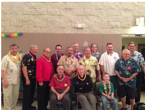
Hawaiian Luau Assembly 2820 @ St Joseph Husband of Mary January 17, 2015